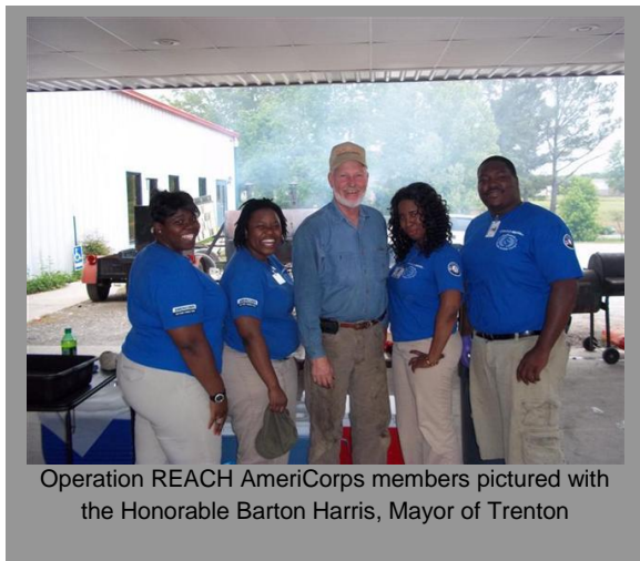
Operation REACH AmeriCorps members pictured with the Honorable Barton Harris, Mayor of Trenton

“It is almost as if a sense of calm permeates in spite of the chaos and destruction, as truly neighbor is helping neighbor”.