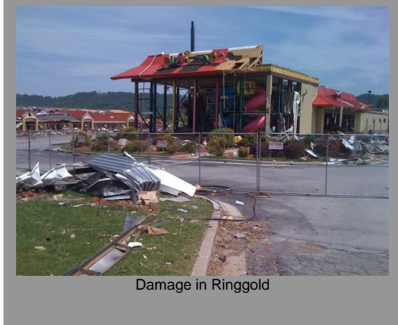
Damage in Ringgold